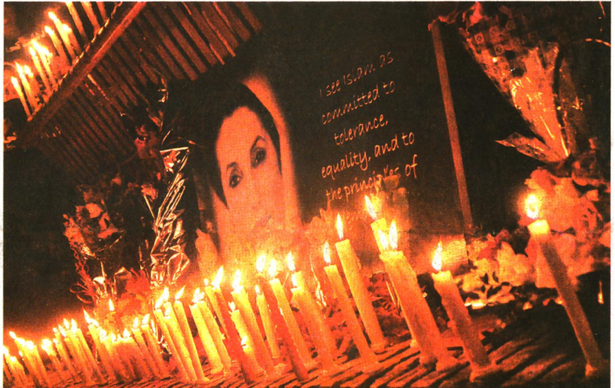
ETERNAL FLAME: Candles were lit up on Monday by a gathering of civil society members at Super Market, Islamabad, to pay tribute to the assassinated leader.